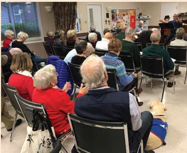
The "Elderly Brothers" were one of many guest speakers/performers at Men's Club meetings.

Now, there's a tradition to keep up with! Today's Men's Group also has regular guest speakers (except in Covid times), and tackles upkeep and maintenance projects. And, of course, it goes without saying that its members are 'keen-minded'!